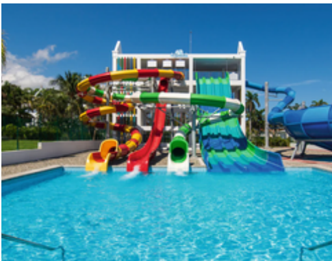
Splash Water World Water Park