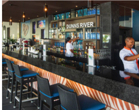
Dunn's River (lobby)