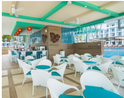
Poolside Restaurant (buffet)