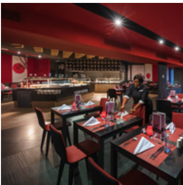
Mandalay - Asian (buffet)