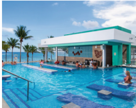
Reggae Swim-Up Bar (poolside)