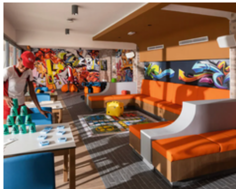
Riu4U Club for teenagers