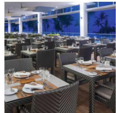
Steakhouse (a la carte)

Distinguished service for distinguished people