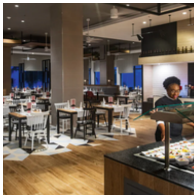
Piacenza - Italian (buffet)