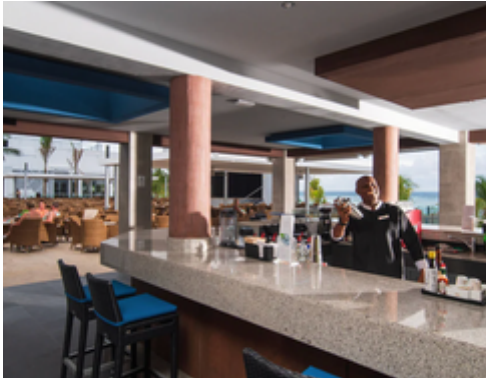
Blue Mountain (lobby)