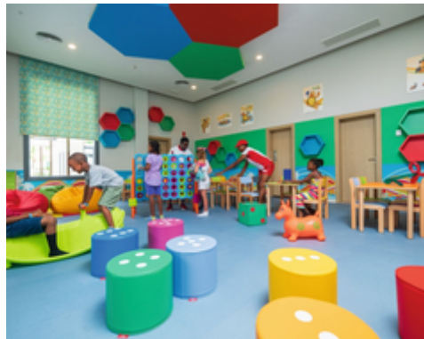
RiuLand Kids Club