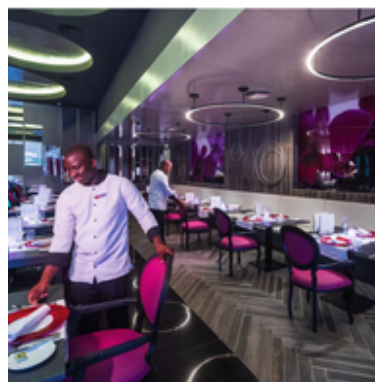
Kulinarium (a la carte)