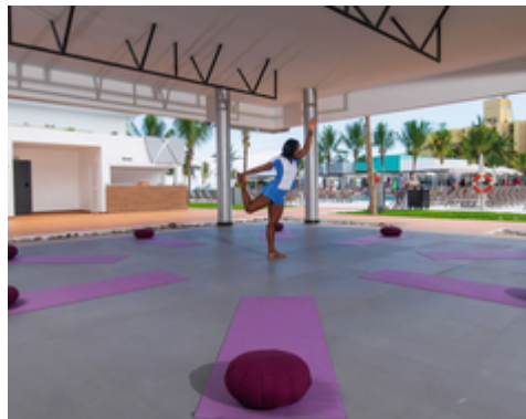
RiuFit Outdoor Pavillion