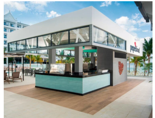
Pepe's Food (jerk station)