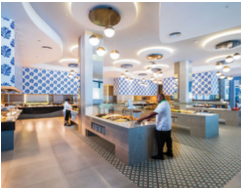
St. Ann - Main restaurant (buffet)