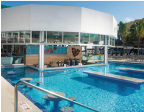
Rastafari Swim-Up Bar (poolside)