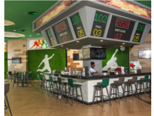
Sports Bar (lobby)