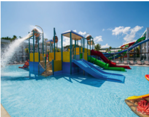
Children's swimming pool with slides