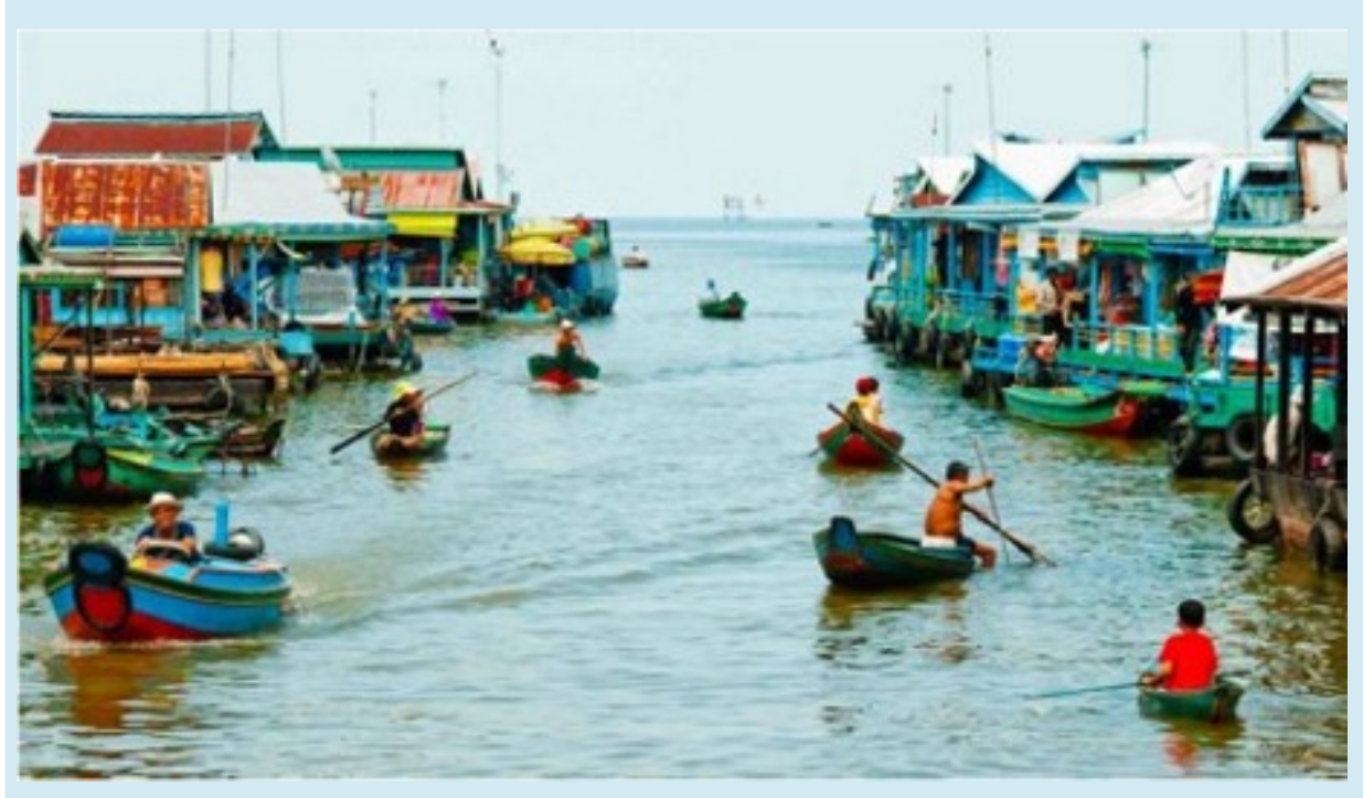
FULL DAY EXPLORE FLOATING VILLAGES ON TONLE SAP LAKE AND ENCOUNTER WITH POL POT SURVIVOR

8:30AM DEPART FROM YOUR HOTEL. WE TRANSFER OUT OF TOWN TO VISIT ONE OF THE FLOATING VILLAGES ON TONLE SAP LAKE. EN ROUTE, MAKE A STOP TO VISIT CAMBODIAN COUNTRYSIDE VILLAGES, INTERACTING WITH LOCALS, SEEING MARKETS, PAGODAS. AFTERWARD, CONTINUE YOUR DRIVE UNTIL YOU REACH THE PORT WHERE YOU EMBARK ON A LOCAL WOODEN BOAT. THE TRIP WILL TAKE YOU TO DISCOVER THE FLOATING VILLAGE ON HOW PEOPLE LIVE AND TRADE. THIS VILLAGE IS HOME TO THOUSANDS OF FAMILIES, AND IT'S THE LARGEST FLOATING VILLAGE IN TONLE SAP.